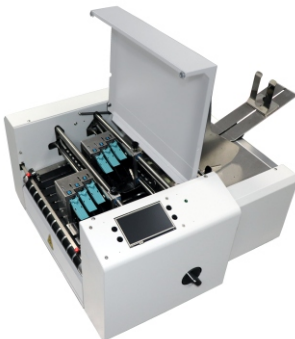
Six proprietary Inkjet cartridges deliver 3" print area for quality addressing.