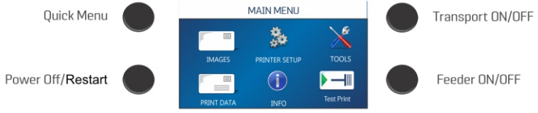
Easy to use: Large touchscreen provides full printer control and system status!