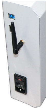
Three PC interface ports: USB 3.1, Ethernet, WiFi

Specifications are subject to change without notice.